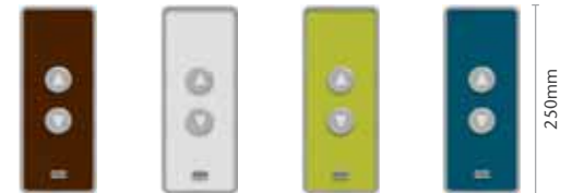
Brown Snow White Green Blue