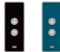
Ivory Black Blue