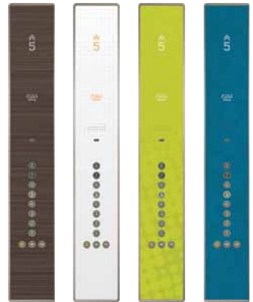
Dark Bamboo White Wire Citylights Green Blue Diamond