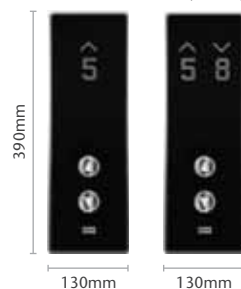
Simplex Duplex • Dotmatrix • Dotmatrix