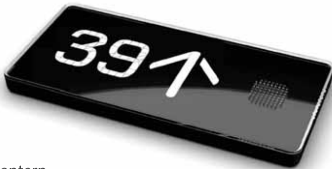
Hall Lantern (HL)