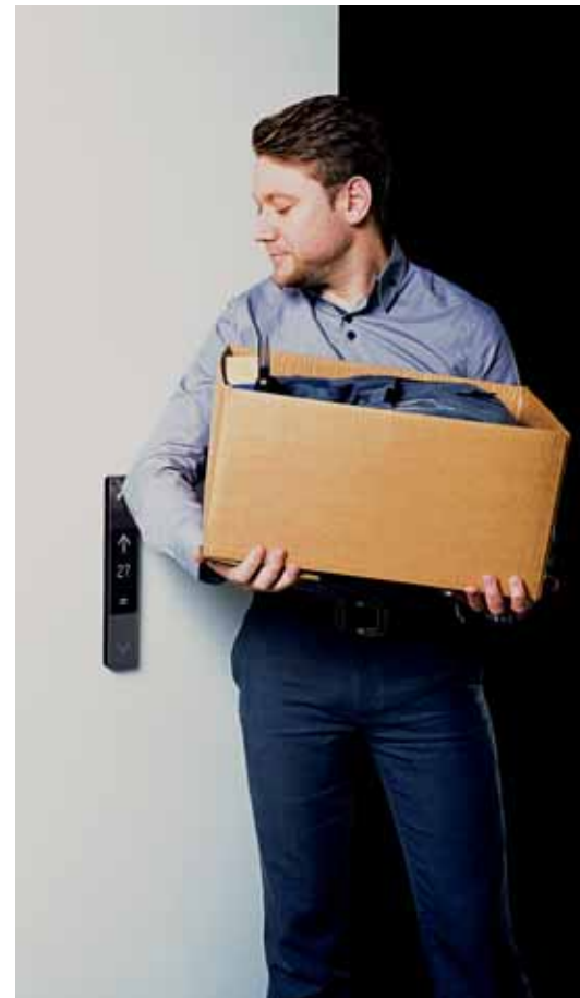
Large, clear landing call buttons for ease and convenience.